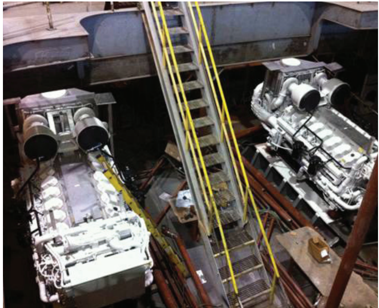
The new EPA Tier 3 Cat® C175 ACERT 16-cylinder main propulsion diesel engines on the Signet Maritime tug.

About Signet Maritime: Signet Maritime Corporation, with its Colle division, is a full service domestic and international marine transportation company. Signet specializes in harbor tugboat operations, ocean rig transport, heavy-lift cargo barges, petroleum transport and marine logistics. The fleet consists of thirty-five (35) vessels including twenty-five (25) ocean and harbor tugboats, seven (7) ocean and inland barges and three (3) ASD Z-Drive tugboats under construction to handle LNG shipments, harbor docking and ocean towing. Signet owns and operates a full service shipyard and husbanding facility for vessels ranging from 25' to 200' in size. Headquartered in Houston, Texas, Signet operates in Pascagoula, Mississippi, Morgan City, Louisiana, Ingleside, Texas, Brownsville, Texas, Dubai UAE, and Brazil SA. Signet is certified by the American Bureau of Shipping to ISO 9001:2008 and ISM, as well as STCW-95, MTSA, AWO-RCP.